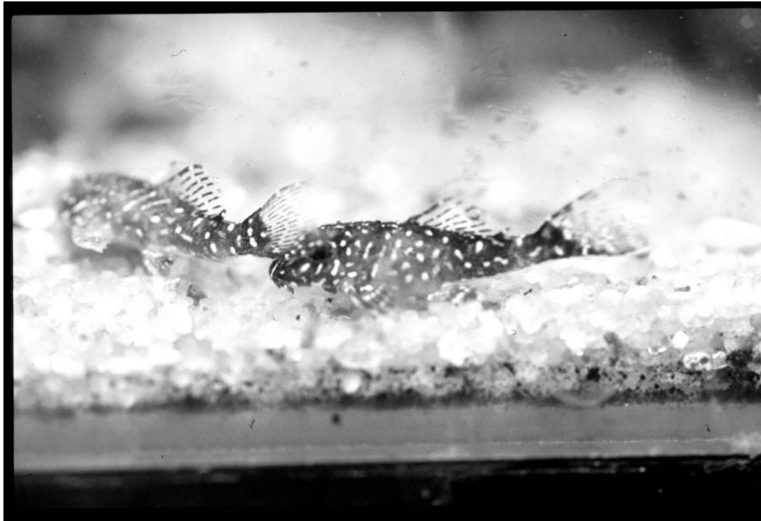
L135a - fry

become far more active than usual, I decided that it would be a good idea to make more frequent water changes, from twice weekly to daily, because with the higher temperature the fish were eating more, producing more waste and I wanted to maintain the water quality. There was one fish however that seemed totally unmoved by all the activity and that was the 'Stardust' male. He remained in the tube and would not venture out, even for some chopped earthworm. I thought no more of it, thinking that he was just not hungry at that time and would come out and feed when there weren't any distractions (Me). Because of the angle of the tube it was virtually impossible to see into inside so I left him alone to do his own thing. It wasn't until nearly two weeks later, that I noticed six little fry scurrying around under the bogwood. So now I knew why the male would not venture out side of his tube, he was guarding a batch of eggs.